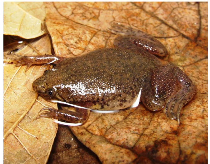
FIGURE 1. Pipa carvalhoi (MZUFV 8671, female, in life) from Sete Lagoas, municipality of Ferros, Minas Gerais.

2008). Herein we present data on the distribution of P. carvalhoi in the southeast of Brazil, as also new records in state of Minas Gerais, improving the knowledge about its geographic distribution.