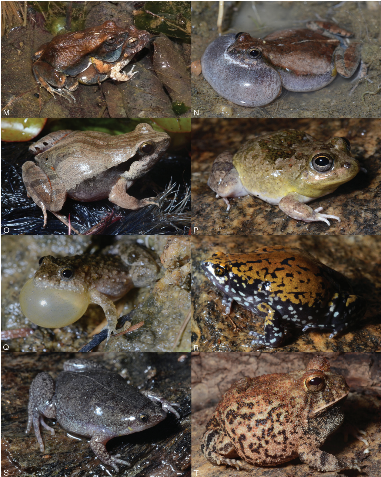
Figure 3 (continued). Anurans registered at the Middle Jaguaribe River Region, Ceará State, northeastern Brazil: M = couple of Physalaemus cicada (AAGARDA ); N = Physalaemus cicada (AAGARDA 10329); O = Physalaemus cuvieri (AAGARDA 10394); P = Pleurodema dipolister (AAGARDA 10349); Q = Pseudopaludicola pocoto (AAGARDA 10335); R = Dermatoneotus muelleri (AAGARDA 10209). Anurans registered at the Middle Jaguaribe River region, Ceará State, northeastern Brazil: S = Elachistocleis piauiensis (AAGARDA 10251); T = Proceratophrys cristiceps (AAGARDA 10401).