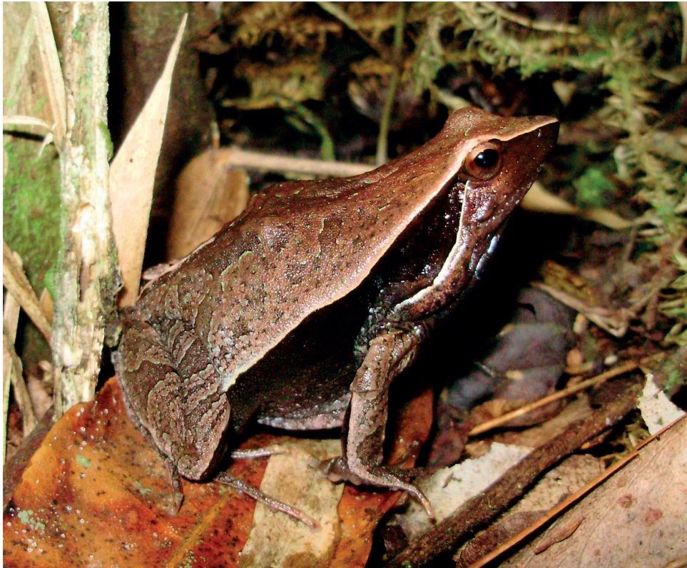
Figure 1. An adult male Physalaemus maximus (MZUFV 10200, 46.3 mm snout-vent length) whose call was recorded in the Serra do Brigadeiro State Park, municipality of Araponga, Minas Gerais, Brazil.