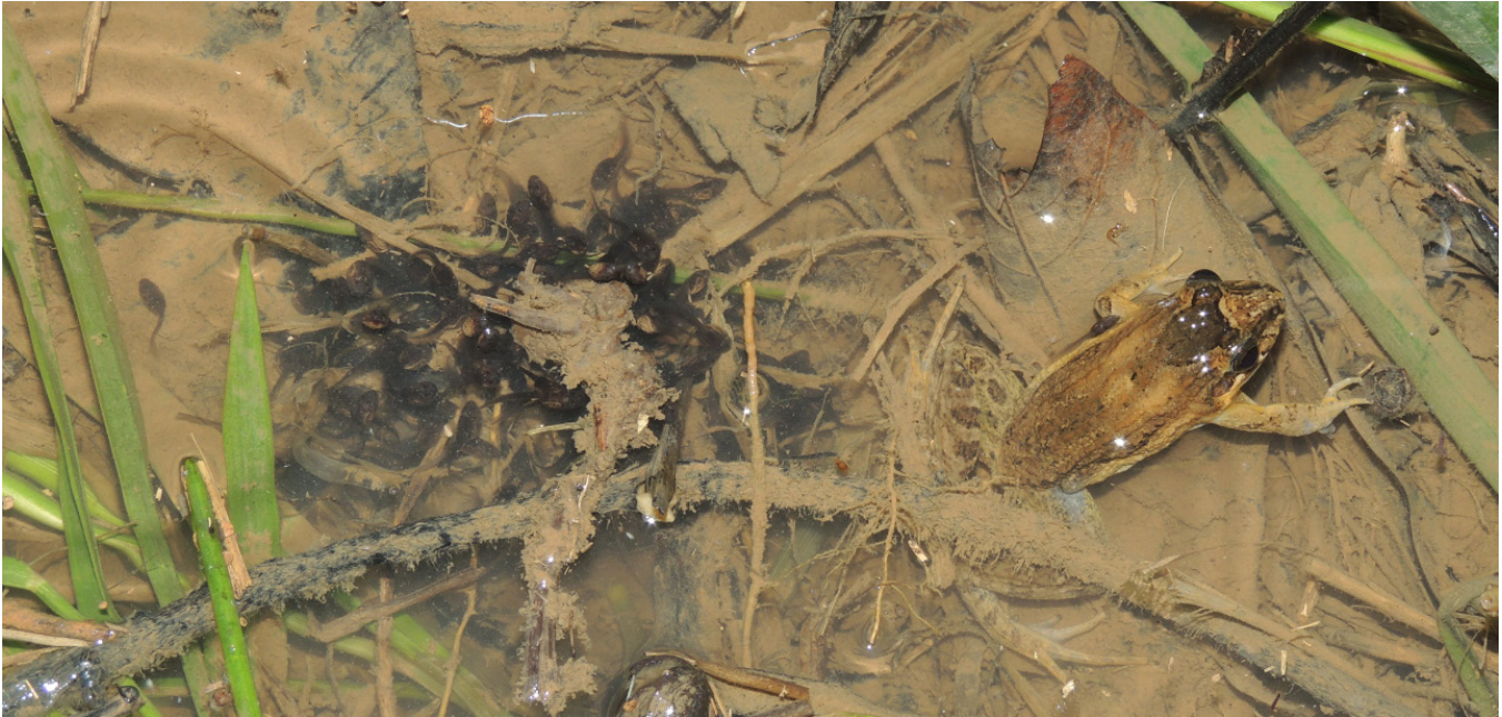
Figura 1. Cardumen de renacuajos (izquierda) y hembra asistente de Leptodactylus brevipes en el Parque Estadual das Nascentes do Rio Taquari, estado de Mato Grosso do Sul, centro de Brasil.