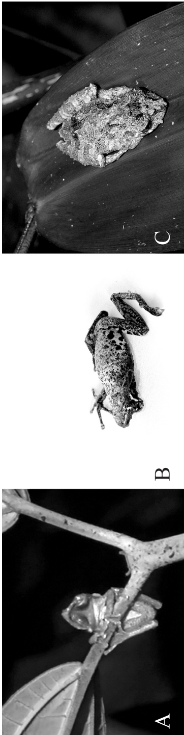
Fig. 1: Individuals of Oolygon carnevallii CARAMASCHI & KISTEUMACHER, 1989, performing the defensive behaviors of: A – mouth-gaping, B – thanatosis and C – crouching down.

Abb. 1: Formen des Abwehrverhaltens bei Oolygon carnevallii CARAMASCHI & KISTEUMACHER, 1989. A – Aufsperrten des Maules, B – Thanatose (Totstellen), C – geduckte Kauerstellung.