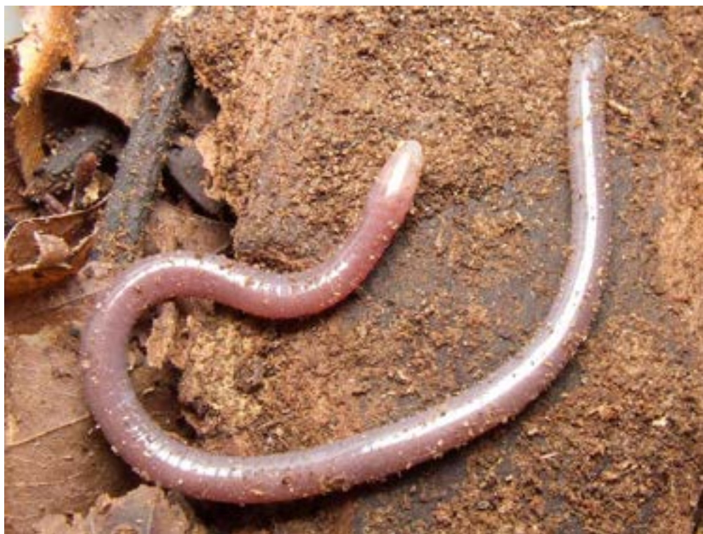
Figure 2. Siphonops hardyi (MZUFV 8748) in life.

Caecilians are hard to collect due to their subterranean or aquatic habits and thus many aspects of their biology are poorly known (Oommen et al. 2000). Currently there are many hydroelectric projects in the Rio Doce basin in Atlantic Rainforest domain. Thus, negative impacts on populations of amphibians may be occurring, due to the landscape alterations promoted by dam flooding. Our record was made in a forest fragment located in the vicinity of an area directly affected by a possible dam flooding.