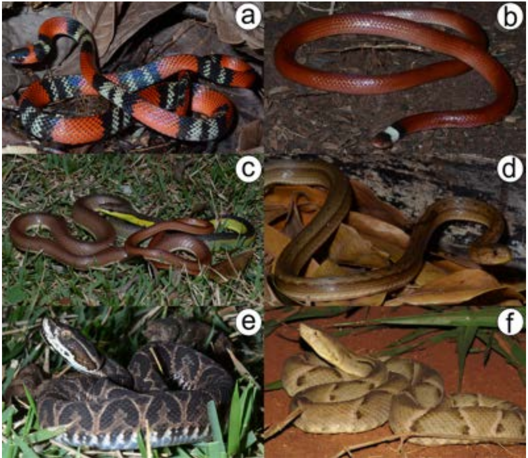
Figure 2. Live individuals of some of the species of snakes known from Campo Grande municipality, Mato Grosso do Sul State, Brazil: (a) Oxyrhopus guibei ; (b) Phalotris matogrossensis ; (c) Philodryas matogrossensis ; (d) Thamnodynastes hypoconia ; (e) Bothrops alternatus ; (f) Bothrops moojeni .

followed by Colubridae (6), Viperidae (5), Elapidae (2), Anomalepididae (1), Boidae (1), Leptotyphlopidae (1) and Typhlopidae (1). The most abundant species in the collection were Oxyrhopus guibei (28), Sibynomorphus ventrimaculatus (22), S. mikanii (16) and Crotalus durissus (14). From the 38 recorded species, only three ( Liotyphlops beui , O. guibei , C. durissus ) were evaluated by IUCN, all of which are categorized as Least Concern (LC), and in the Brazilian Red List from ICMBio, all species registered in this study are categorized as LC as well. We examined specimens of eight Cerrado endemic species: Trilepida koppesi , Chironius flavolineatus , Chironius quadricarinatus , Simophis rhinostoma , Erythrolamprus frenatus , Phalotris matogrossensis ,