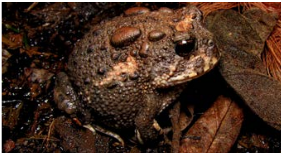
Figure 1. Odontophrynus cultripes. Adult male in life from Parque Estadual da Serra do Brigadeiro, municipality of Araponga, state of Minas Gerais, Brazil (unvouchered species).