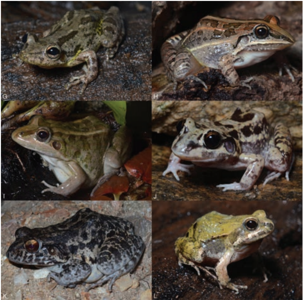
Figure 3 (continued). Anurans registered at the Middle Jaguaribe River region, Ceará State, northeastern Brazil: G = Scinax x-signatus (AAGARDA 10241); H = Leptodactylus fuscus (AAGARDA 10336); I = Leptodactylus macrosternum (AAGARDA 10188); J = Leptodactylus troglodytes (AAGARDA 10282); K = Leptodactylus vastus (AAGARDA 10339); L = Physalaemus albifrons (AAGARDA 10254).

these spots are located in the northeastern region of the Ceará State – the most impacted area in the state by human activities – and also in close contact with coastal lowland regions.