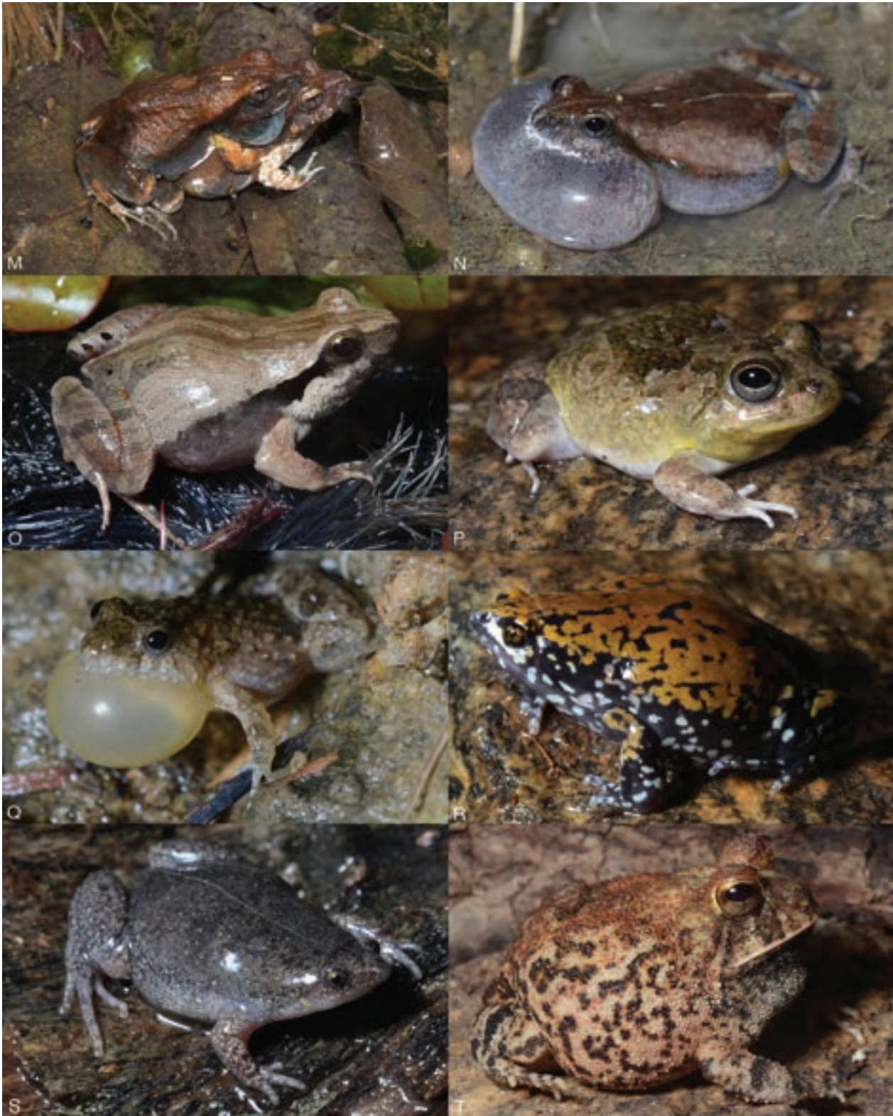
Figure 3 (continued). Anurans registered at the Middle Jaguaribe River Region, Ceará State, northeastern Brazil: M = couple of Physalaemus cicada (AAGARDA ); N = Physalaemus cicada (AAGARDA 10329); O = Physalaemus cuvieri (AAGARDA 10394); P = Pleurodema dipolister (AAGARDA 10349); Q = Pseudopaludicola pocoto (AAGARDA 10335); R = Dermatoneotus muelleri (AAGARDA 10209). Anurans registered at the Middle Jaguaribe River region, Ceará State, northeastern Brazil: S = Elachistocleis piauiensis (AAGARDA 10251); T = Proceratophrys cristiceps (AAGARDA 10401).