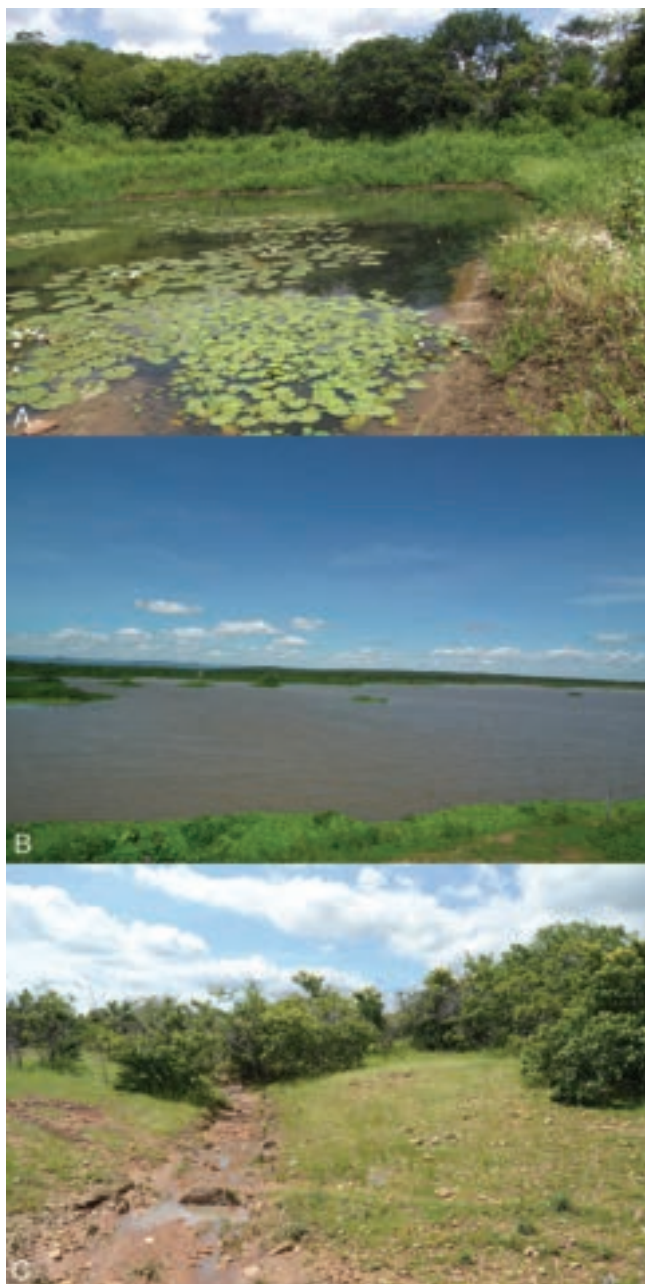
Figure 2. Landscapes in the Middle Jaguaribe River region, State of Ceará, northeastern Brazil, and some examples of sampled habitats: A = permanent pond in Serra do Barro Vermelho; B = Santana Dam near the survey site 2; C = temporary stream in a Caatinga area at Mr. Alzir Farm.

and with small temporary ponds). Each study site was surveyed by at least five researchers simultaneously. Our field inventory methods followed the “Complete Species Inventories”, “Visual Encounter Surveys”, and “Audio Strip Transects” guidelines of Heyer et al. (1994).