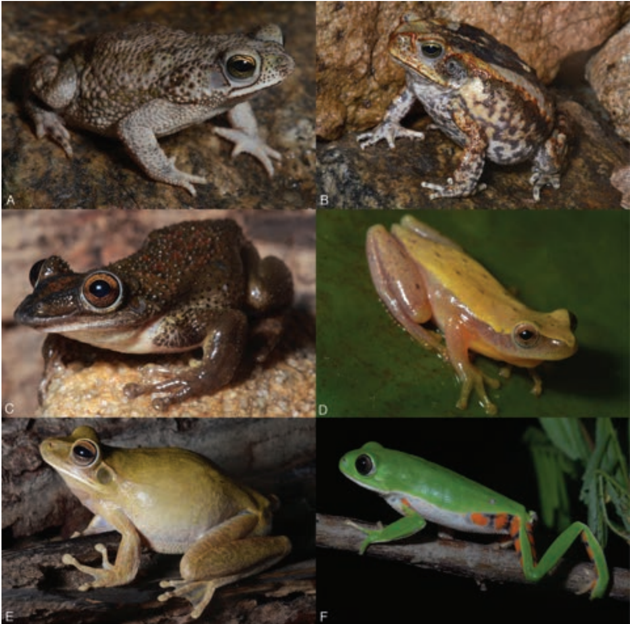
Figure 3. Anurans registered at the Middle Jaguaribe River region, Ceará State, northeastern Brazil: A = Rhinella granulosa (AAGARDA 10216); B = Rhinella jimi (AAGARDA 10292); C = Corythomantis greening (AAGARDA 10391); D = Dendropsophus nanus (AAGARDA 10276); E = Hypsiboas raniceps (AAGARDA 10404); F = Phyllomedusa nordestina (individual not collected).