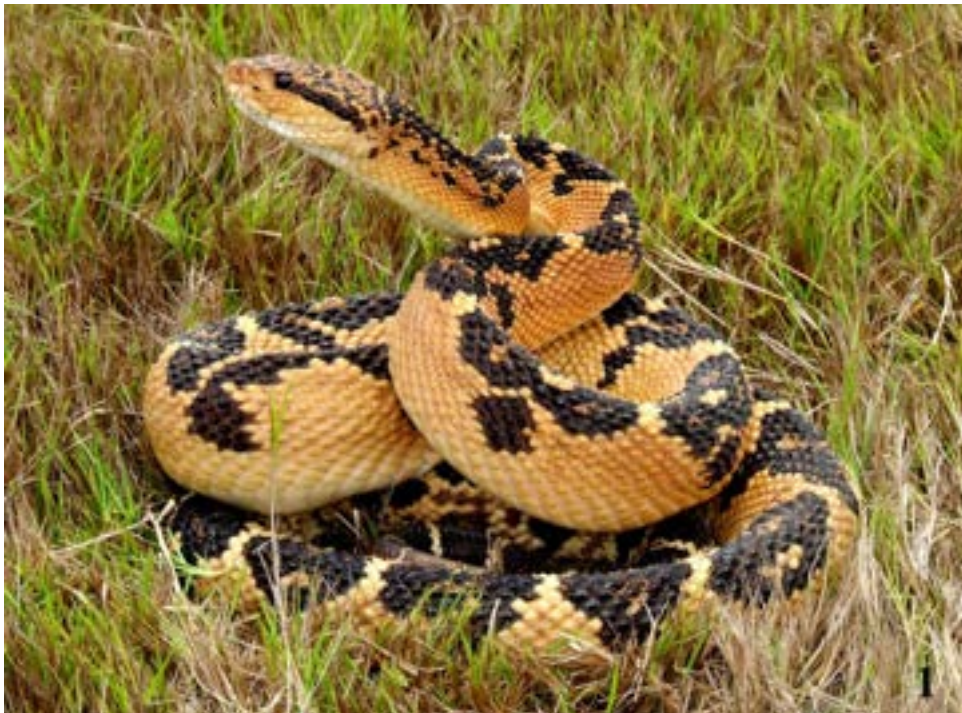
FIGURE 1: Lachesis muta in Cruz do Espírito Santo, Paraíba, Brazil (CHUFPB 00001).