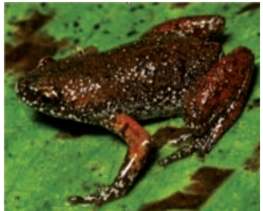
Figure 1. Chiasmocleis mantiqueira from Parque da Lajinha, Juiz de Fora, Minas Gerais. CAUFJF 893 (female)

This record is the first of Chiasmocleis mantiqueira out of its type locality, despite the record from São Paulo state, of which no voucher specimens exist. Thus, the record of C. mantiqueira from Parque Municipal da Lajinha is the southern-most record according to published vouchered data.