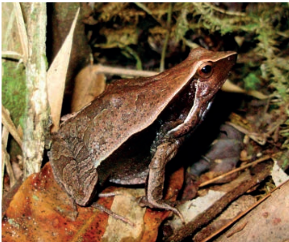
Figure 1. An adult male Physalaemus maximus (MZUFV 10200, 46.3 mm snout-vent length) whose call was recorded in the Serra do Brigadeiro State Park, municipality of Araçuaia, Minas Gerais, Brazil.