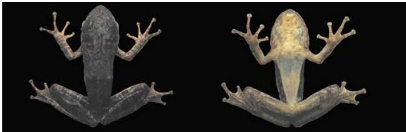
FIGURE 2. Dorsal (A) and ventral (B) view of an adult female Scinax centralis (MZUFV 6511, 26.55 mm snout-vent length) from Campo Alegre de Goiás, state of Goiás, Brazil.