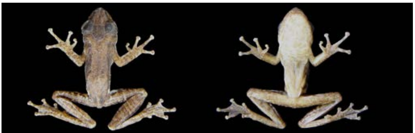
FIGURE 1. Dorsal (A) and ventral (B) view of an adult male Scinax centralis (MZUFV 6509, 22.05 mm snout-vent length) from Campo Alegre de Goiás, state of Goiás, Brazil.

Scinax centralis is distinguished from other closely related species by its small size (SVL 17.8-21.2 mm). This species is also characterized by the presence of developed inguinal glands, snout slightly protruding in lateral view and the presence of a triangular interocular blotch (Pombal and Bastos 1996). Adult females of Scinax centralis (Figure 2) present the same characteristics of males related in the description (Pombal and Bastos, 1996). Females also have inguinal glands and the same patterns of dorsal coloration, and tend to be larger than males (Table 1). Besides the sexual dimorphism reported by Alcantara et al. (2007), two of our four males were larger in SVL than those reported in the original description (larger reported male had 21.2 mm) and also those reported by Alcantara et al. (2007) (males SVL reached 17.05-23.45 mm).