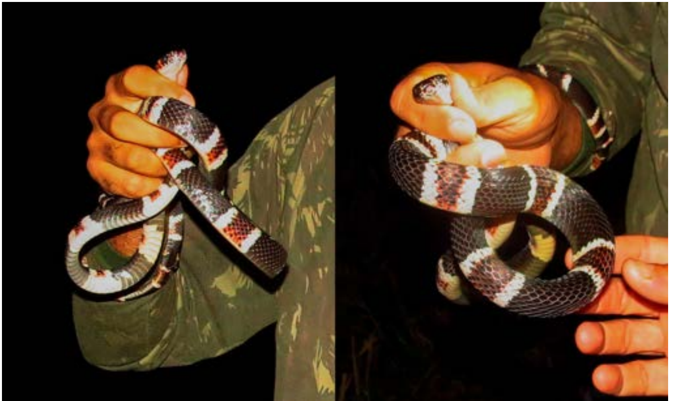
Figura 1. Specimen of Rhinobothryum lentiginosum from Santa Fé do Araguaia, state of Tocantins.