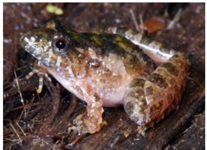
Figure 1. A male Long-legged Swamp Froglet ( Pseudopaludicola murundu) from Bom Jardim de Minas, Minas Gerais, Brazil (ZUFMS-AMP19383).