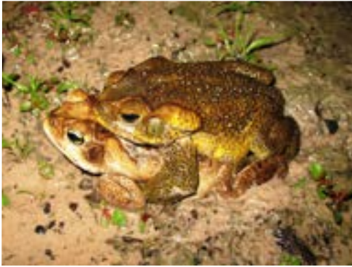
Figure 2. Rhinella cerradensis couple in amplexus from municipality of Itiquira, state of Mato Grosso, Brazil.

The present note provides the first record for Rhinella cerradensis in the state of Mato Grosso, Brazil, extending its known distribution ca. 100 km northwest from municipality of Mineiros, state of Goiás (Maciel et al. , 2007) (Fig. 3).