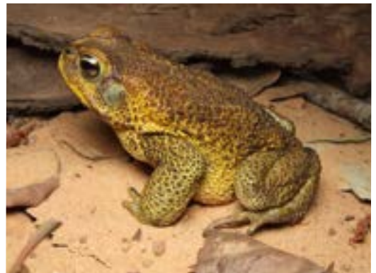
Figure 1. Rhinella cerradensis (MZUSP 142012, male) from municipality of Itiquira, state of Mato Grosso, Brazil.