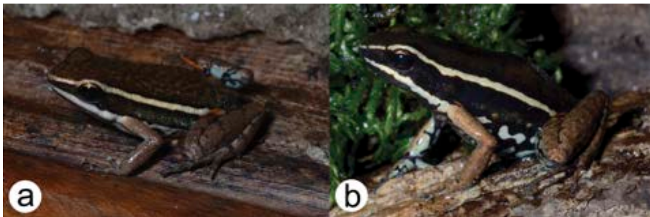
Figure 1. Poison frogs from Pantanal surrounding uplands of Mato Grosso do Sul state (a) Ameerega berohoka , from Serra de Maracaju, in Rio Negro municipality and (b) Ameerega picta , from Serra da Bodoquena, in Bonito municipality.

We captured 24 individuals (14 males and 10 females) of Ameerega berohoka from the Rio Peixe Waterfall (19°34'31"S, 54°53'37"W), a hillside area of the Serra de Maracaju in the Rio Negro municipality, Mato Grosso do Sul state, Brazil. For A. picta , we captured 22 individuals (15 males and 07 females) from the Estância Mimosa (20°58'49"S, 56°30'32"W), located in the Serra da Bodoquena, Bonito municipality, Mato Grosso do Sul state, Brazil (Figure 2). The specimens were collected during two field trips, one in April and the other in May 2016. The individuals were found and collected through visual encounter surveys (Crump & Scott 1994). The specimens were killed using topical anesthetic (lidocaine 5%) and then fixed in 10% formaldehyde before analyzing their stomach content. All individuals were considered adults, as we confirmed the development of gonads during the dissection process. The captured specimens were collected with permission from the Brazilian wildlife regulatory service (SISBIO #49080-1) and are housed at Coleção