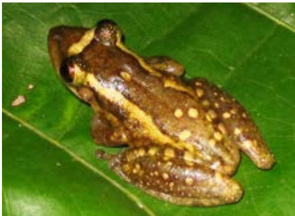
Figure 1. Scinax auratus (MZUFV 5473, male) from Fazenda Santana, municipality of Salto da Divisa, Minas Gerais, Brazil.

Scinax auratus (Wied-Neuwied, 1821) (Figures 1 and 2) is a small hylid treefrog associated with the Scinax ruber clade ( sensu Faivovich 2002), occurring in the Atlantic Forest of northeastern Brazil (Alves et al. 2004; Frost 2009). This species inhabits forests and rocky outcrops along the border of forested and open areas (Alves et al. 2004). It is generally found inside terrestrial and epiphytic bromeliads, or calling inside bushes and grassy vegetation associated to lentic water bodies, where it reproduces (Bokermann 1969).