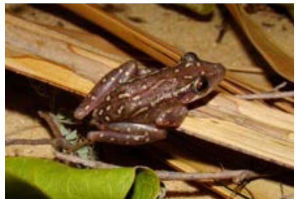
Figure 2. Scinax auratus (LZV-A 1146, male) from Reserva Biológica de Santa Isabel, municipality of Pirambú, Sergipe, Brazil.

In the present paper we report new records for Scinax auratus and a map representing the distribution of this species (Figure 3) based on published data, specimens collected by the authors, and specimens deposited in the following Brazilian herpetological collections: Museu de Zoologia João Moojen, Universidade Federal de Viçosa, Viçosa, state of Minas Gerais (MZUFV); Laboratório de Zoologia dos Vertebrados, Universidade Federal de Ouro Preto, Ouro Preto, state of Minas Gerais (LZV/UFOP); and Museu de Zoologia da Universidade Federal da Bahia, Salvador, state of Bahia (UFBA).