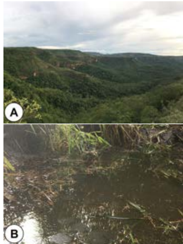
Figure 2. (A) Panoramic view of the Parque Estadual das Nascentes do Rio Taquari and (B) the surveyed temporary pond; egg masses of Chiasmocleis mehelyi visible floating on the surface.

To evaluate whether frog populations are selectively choosing a specific prey category, we calculated the Linear Food Selection Index (LI), according to the following equation: LI = r_i - p_i , where r_i and p_i are the relative abundances (expressed in this case as proportions) of prey item i in the stomachs and habitat, respectively (Strauss 1979). This index ranges from -1 to +1, with positive values indicating preference, values near 0 indicating random feeding, and negative values - avoidance or inaccessibility (Strauss 1979).