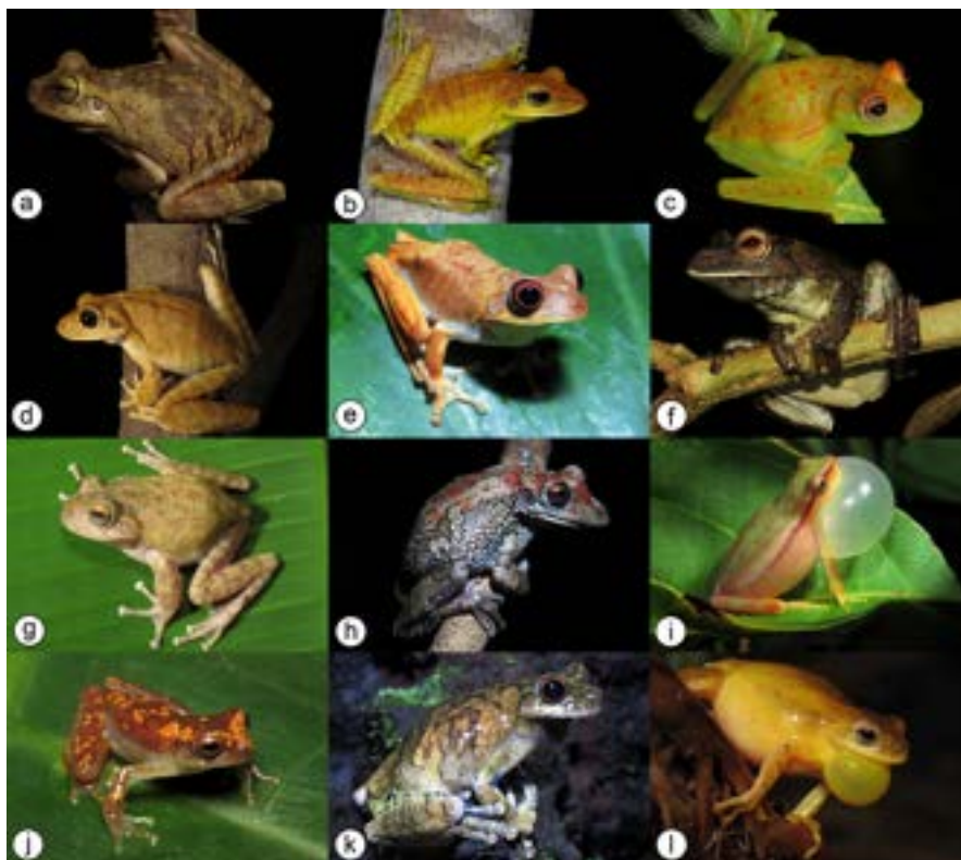
Figure 3. Amphibian species recorded in the State of Tocantins. Hylidae: a) Boana crepitans ; b) Boana multifasciata ; c) Boana punctata ; d) Boana raniceps ; e) Boana sp. (aff. semilineata); f) Boana sp. (cf. wavrini); g) Bokermannohyla pseudopseudis ; h) Corythomantis greeningi ; i) Dendropsophus anataliasiasi ; j) Dendropsophus cruzi ; k) Dendropsophus melanargyreus ; l) Dendropsophus minutus.