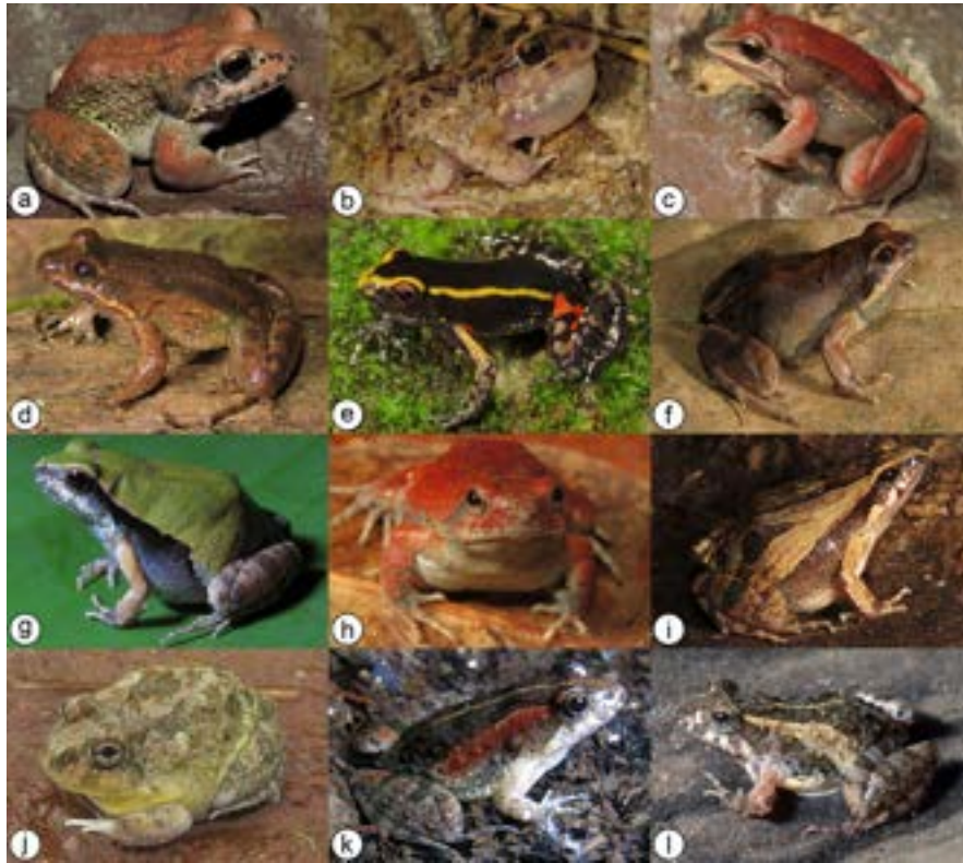
Figure 6. Amphibian species recorded in the State of Tocantins. Leptodactylidae: a) Leptodactylus syphax ; b) Leptodactylus troglodytes ; c) Leptodactylus sp. (aff. mystaceus ); d) Leptodactylus sp. (gr. melanonotus ); e) Lithodytes lineatus ; f) Physalaemus centralis ; g) Physalaemus cuvieri ; h) Physalaemus nattereri ; i) Physalaemus sp. (gr. cuvieri ); j) Pleurodema diplolister ; k) Pseudopaludicola canga ; l) Pseudopaludicola jazmynmcdonaldae .