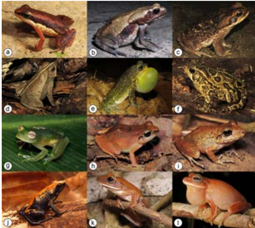
Figure 2. Amphibian species recorded in the State of Tocantins. Aromobatidae: a) Allobates crombiei ; Bufonidae: b) Rhaebo guttatus ; c) Rhinella diptycha ; d) Rhinella gildae ; e) Rhinella mirandaribeiroi ; f) Rhinella ocellata ; Centrolenidae: g) Hyalinobatrachium taylori ; Craugastoridae: h) Barycholos ternetzi ; i) Pristimantis sp. (aff. fenestratus); Dendrobatidae: j) Adelphobates galactonotus ; Hylidae: k) Boana albopunctata ; l) Boana caiapo.