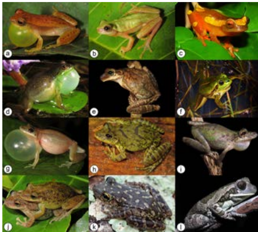
Figure 4. Amphibian species recorded in the State of Tocantins. Hylidae: a) Dendropsophus nanus ; b) Dendropsophus rubicundulus ; c) Dendropsophus sp. (gr. leucophyllatus ); d) Lysapsus caraya ; e) Osteocephalus taurinus ; f) Pseudis tocantins ; g) Scinax fuscomarginatus ; h) Scinax fuscovarius ; i) Scinax nebulosus ; j) Scinax x-signatus ; k) Scinax sp. (gr. ruber ); l) Trachycephalus typhonius .