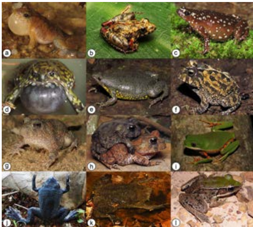
Figure 7. Amphibian species recorded in the State of Tocantins. Leptodactylidae: a) Pseudopaludicola mystacalis ; b) Pseudopaludicola sp. (gr. saltica); Microhylidae: c) Chiasmocleis centralis ; d) Dermatoneustes muelleri ; e) Elachistocleis sp.; Odontophrynidae: f) Proceratophrys branti ; g) Proceratophrys goyana ; h) Proceratophrys sp. (aff. concavitympanum); Phyllomedusidae: i) Pithecopus azureus ; j) Pipidae: j) Pipa arrabali ; k) Pipa pipa ; Ranidae: l) Lithobates palmipes.