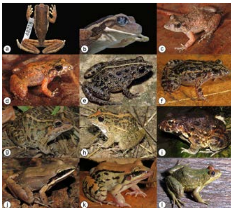
Figure 5. Amphibian species recorded in the State of Tocantins. Hylidae: a) Trachycephalus sp.; b) Trachycephalus sp.; Leptodactylidae: c) Adenomera cotuba ; d) Adenomera juikitan ; e) Adenomera saci ; f) Adenomera sp. 1; g) Leptodactylus chaquensis ; h) Leptodactylus fuscus ; i) Leptodactylus labyrinthicus ; j) Leptodactylus mystaceus ; k) Leptodactylus mystacinus ; l) Leptodactylus pustulatus .