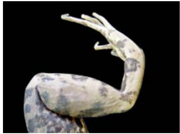
Figure 2. Detail of the leg of a Leptodactylus viridis specimen (MZUFV 5460) from Fazenda Santana , municipality of Salto da Divisa, Minas Gerais, Brazil. Note the light spiculae on longitudinal lines, characteristic of this species.

Leptodactylus viridis is currently defined as Data Deficient by the IUCN redlist (IUCN 2009). The record of L. viridis from municipality of Salto da Divisa represents the first record of this species in the state of Minas Gerais and the westernmost register, 210 km southward Itagibá (type locality) and 60 km northwestward Guaratinga (Figure 3). The collected specimen was found near a temporary pond in open habitat, an environment similar to that reported in the description of the species.