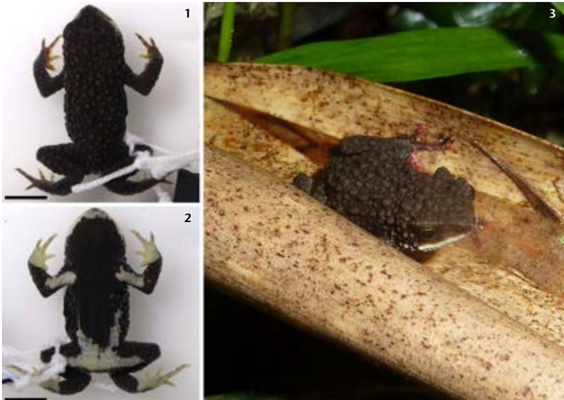
Figures 1–3. Specimens of Melanophryniscus xanthostomus : dorsal view (1) and ventral view (2) from FURB 22851 specimen and FURB 22713 specimen in life (3).

We analyzed calls in RAVEN PRO 1.5 for Mac (Bioacoustics Research Program 2012) and constructed audio spectrograms in R using the package seewave (Sueur et al. 2008) with the following parameters: FFT window width = 256, Frame = 100, Overlap = 75, and flat top filter. We analyzed acoustic parameters normally used for species of Melanophryniscus : dominant frequency (Hz), call duration (sec), call interval (sec), first segment duration (sec), second segment duration (sec), interval between first and second segment (sec), number of short notes, duration of short notes (sec), interval between short notes (sec), note rate of the first segment (the ratio of the absolute number of notes and the absolute duration of the segment), pulse number of the second segment, and pulse rate of the second segment (the ratio of the absolute number of pulses and the absolute duration of the segment). Terminology of call descriptions follows Köhler et al. (2017).